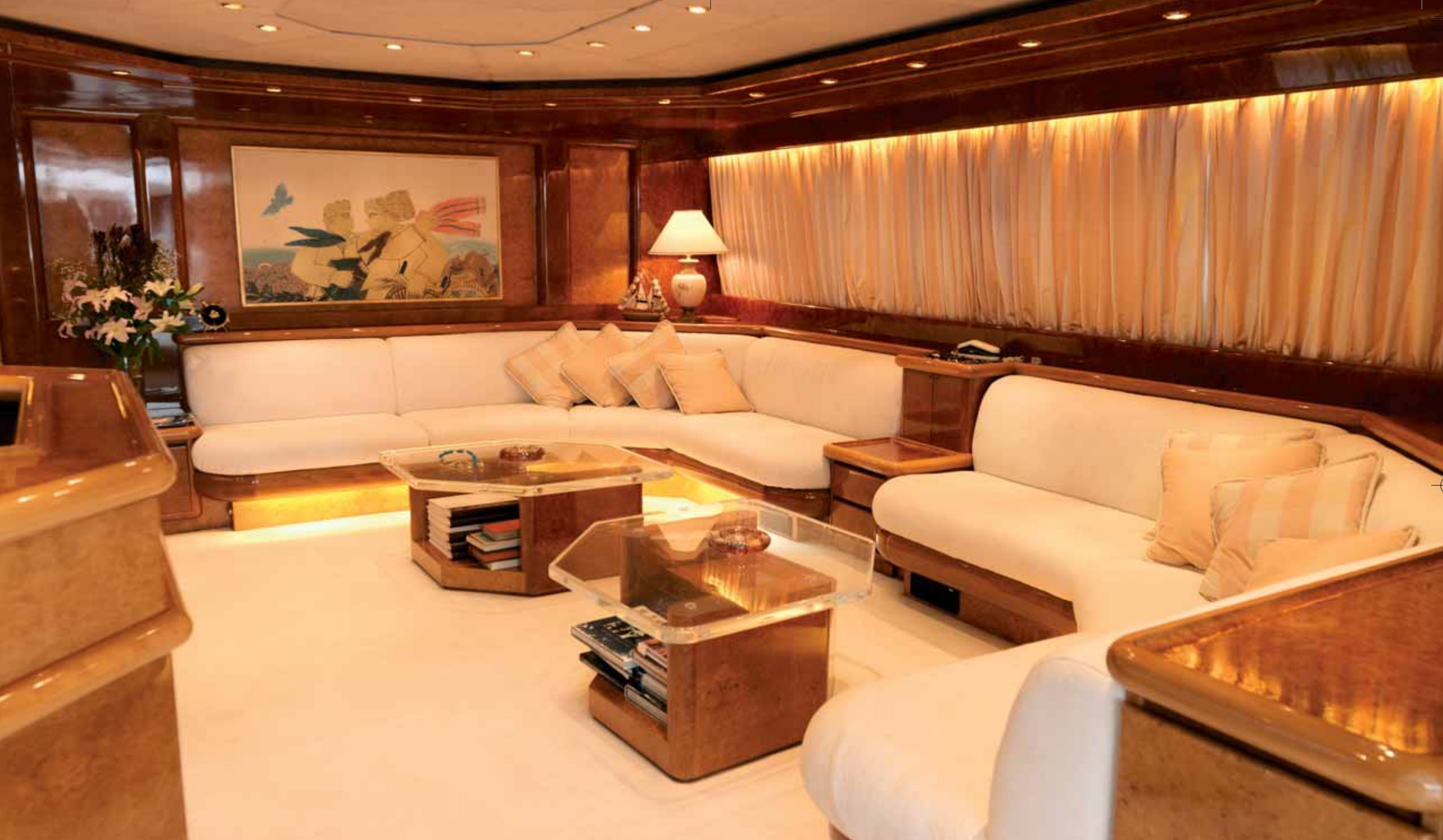
The impressive and spacious salon is dressed in polished rose wood and fine Italian soft fabrics. It is the most suitable place to relax!